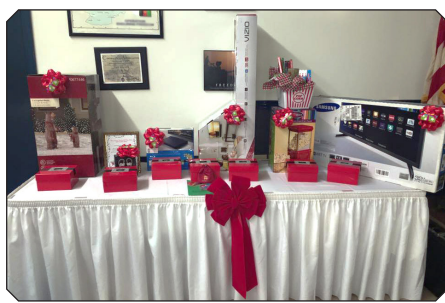
Above: Party prizes. Below: Advantage employees.

There were several great prizes including a 32" flat screen TV, a Vizio sound bar, a bluray player, a popcorn maker, Christmas decor, jewelry, gift cards and more! Overall, everyone had a great time!